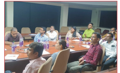
Enthusiastic participants attending the training session on Business Communication Skill conducted by Baroda Productivity Council, on October 28, 2023, at BPC, Baroda.