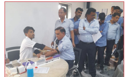
Employees enthusiastically participating in the Medical Check-up camp.